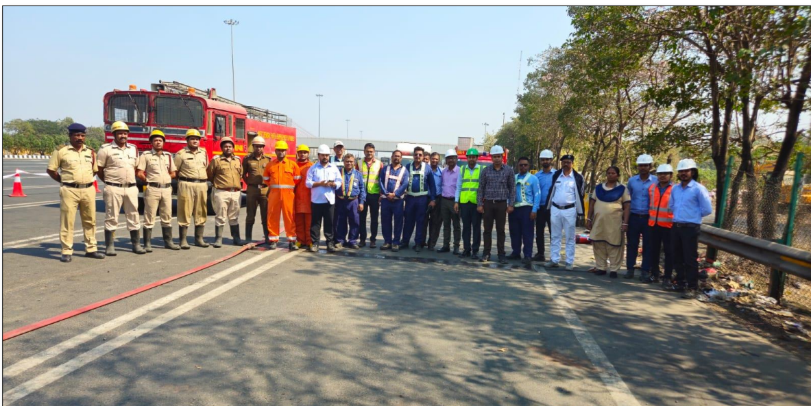
5. Group Picture