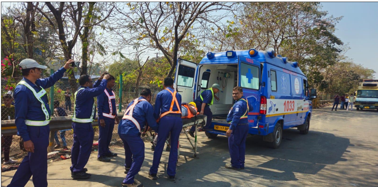
1. Casualty rescue by Incident Management Team from SVBTCPL– Bally