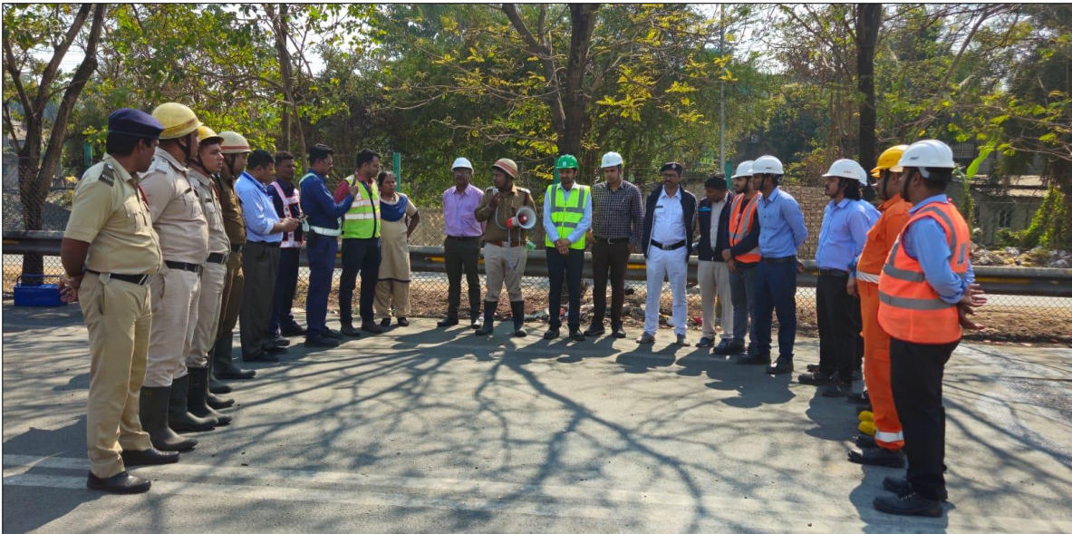
3. Briefing after Mock drill